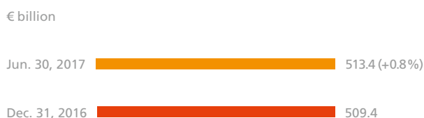
FIG. 3 – TOTAL ASSETS

in the DZ BANK Group had reached €71.3 billion (December 31, 2016: €78.2 billion). The contraction of €6.9 billion was largely due to the decline of €6.9 billion in DZ BANK's debt certificates issued including bonds.